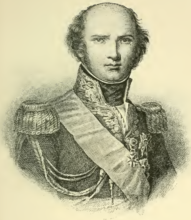
DAVOUST (PRINCE D'ECKMUHL)